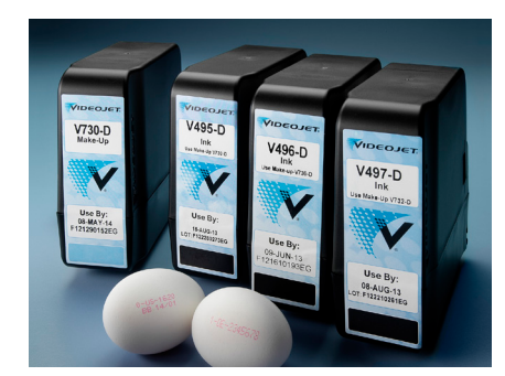
Ink cartridges for printers

Ask your local Videojet representative for assistance on how to specify and design an egg system that will perform reliably for years to come.